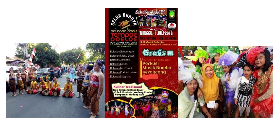
Figure 2: Culture Degree in Penumping Village, Surakarta City

Child Friendly City in Denpasar Bali, as a tourism city with regional cultural insight, innovates in implementing the Eligible City of Children described in the mission; Strengthening children's identity based on Balinese culture; Based on local wisdom through creative culture; Realizing good governance for children (good governance); Improve public environmental services, tourism, and infrastructure. Forming the Denpasar City Children's Forum (FAD) in every Banjar (village), which is active in various activities up to the city level by conducting traditional activities because in Banjar it is emphasized for the preservation of culture, art, and tradition. Strengthening the school leadership can be in the form of understanding of the local culture, benchmarking other schools, providing professional training, instilling good ethics and building a strong character with high integrity (Jumintono, Suyatno, Muhammad Zuharty, 2018).