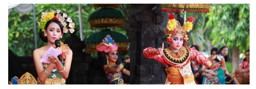
Figure 3: Activities of the Indigenous Dance Festival in Denpasar, Bali

Child Friendly City in Denpasar Bali, as a tourism city with regional cultural insight, innovates in implementing the Eligible City of Children described in the mission; Strengthening children's identity based on Balinese culture; Based on local wisdom through creative culture; Realizing good governance for children (good governance); Improve public environmental services, tourism, and infrastructure. Forming the Denpasar City Children's Forum (FAD) in every Banjar (village), which is active in various activities up to the city level by conducting traditional activities because in Banjar it is emphasized for the preservation of culture, art, and tradition. Strengthening the school leadership can be in the form of understanding of the local culture, benchmarking other schools, providing professional training, instilling good ethics and building a strong character with high integrity (Jumintono, Suyatno, Muhammad Zuharty, 2018).